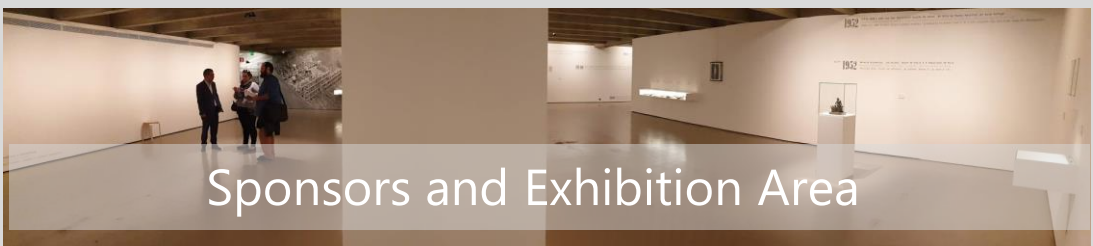
Sponsors and Exhibition Area